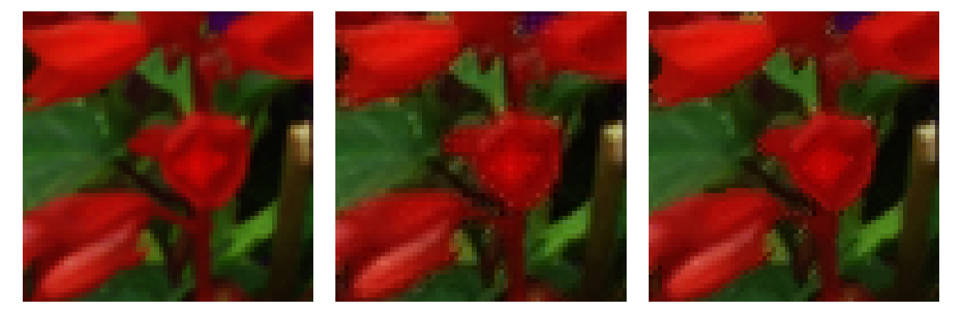
Figure 4: Original image (left) and demosaicking results of Hamilton-Adams algorithm (center) and SSD (right).