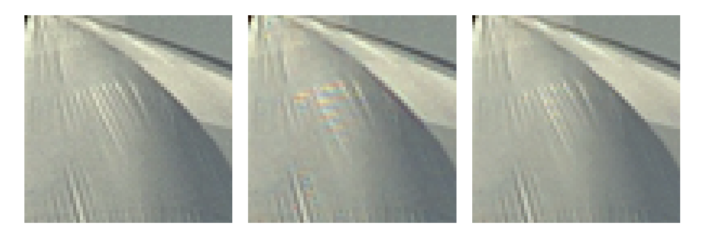
Figure 2: Original image (left) and demosaicking results of Hamilton-Adams algorithm (center) and SSD (right).