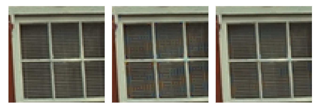
Figure 3: Original image (left) and demosaicking results of Hamilton-Adams algorithm (center) and SSD (right).