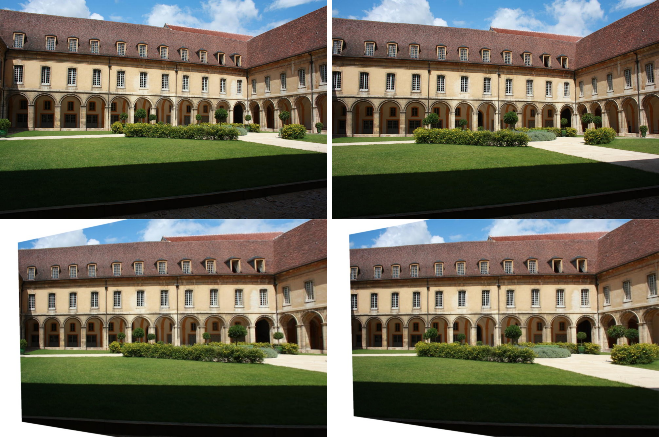
Figure 3: Cluny church: 110 correspondences are found and the final RMSE is 0.27 pixels after 35 iterations.