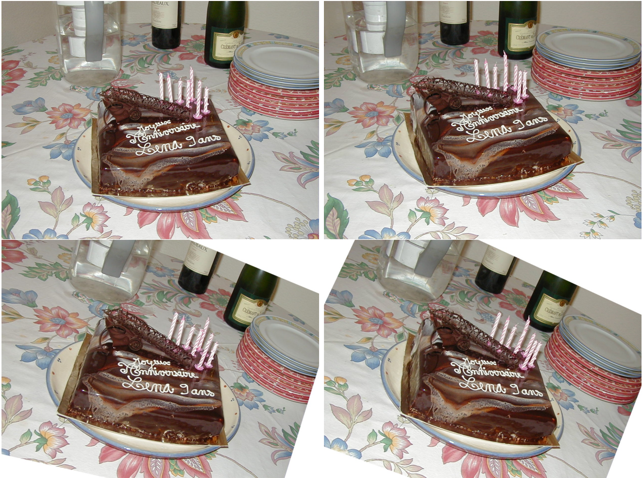
Figure 5: Birthday cake: 146 correspondences are found and the final RMSE is 0.69 pixels after 11 iterations. The final error is higher than in previous examples, due to some geometric distortion of the camera.