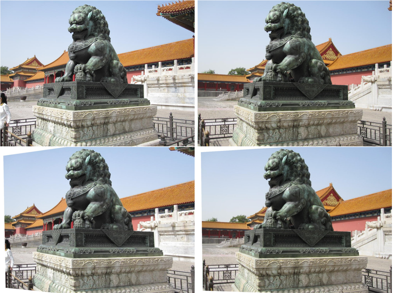
Figure 1: Beijing lion: 107 correspondences are found and the final RMSE is 0.25 pixels after 6 iterations.