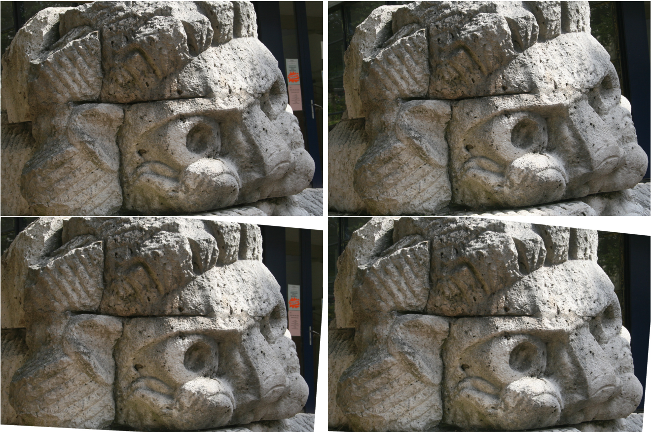
Figure 2: Cachan statue: 964 correspondences are found and the final RMSE is 0.13 pixels after 5 iterations.