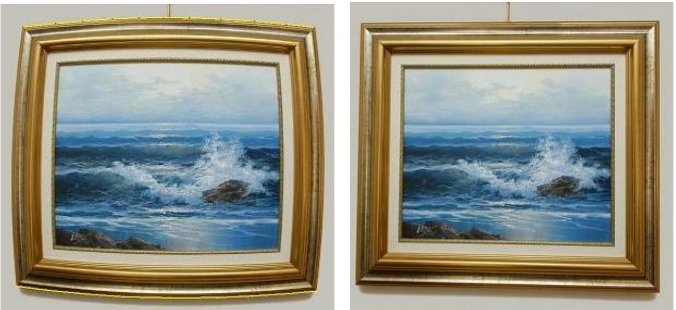
Figure 2: Frame. Left, distorted original image. Right, corrected image.