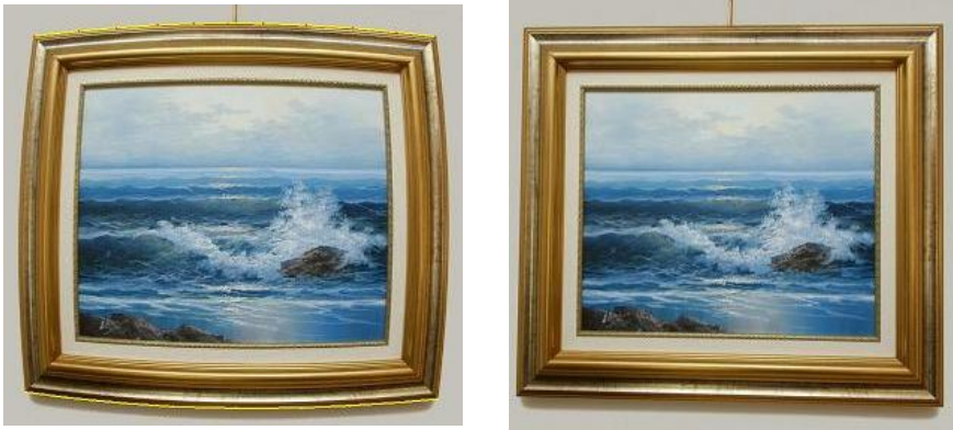
distorted original image (a picture) undistorted original image (a picture)

The second result is for a colour photo showing an important barrel distortion or pincushion distortion. For this case, the user has selected the top border of the frame as a straight reference line. The undistorted image once again reveals that, even selecting a simple primitive, the distortion is firmly corrected.