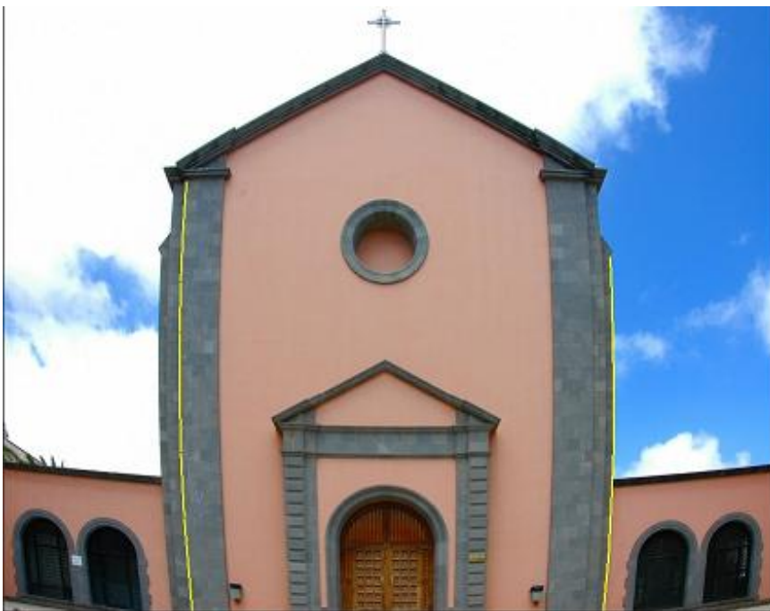
undistorted original image