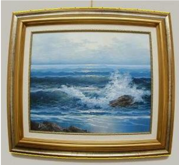
undistorted original image (a picture)